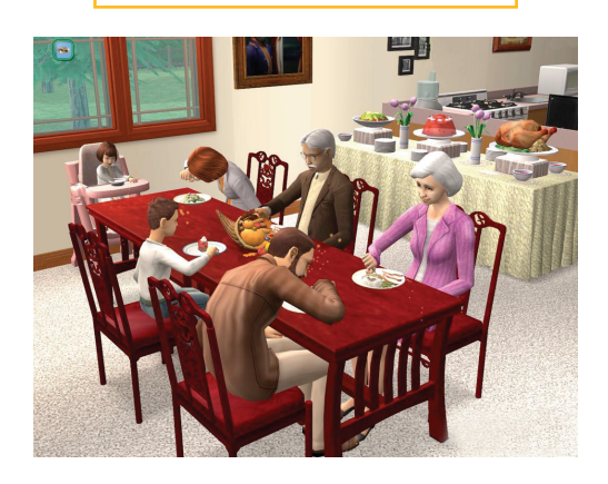
Figure 1 - Images of The Sims game

parameters and references, makes a virtual world available that can be precipitously experienced by its players. The dynamic constructed by the game occurs via the simulation of a "cyberquotidian" in which ordinary activities of daily life are reenacted, such as working, paying bills, dating, sleeping and shopping. Technically, there is no way of winning the game; the goal is to evolve, overcome obstacles, achieve goals and dreams. The player can create avatars, scenes, social relations, in addition to having the power to halt, save, and accelerate the pace of action. The central idea of the game is that of a virtual theater, in which we can entertain ourselves by reenacting and rehearsing aspects of our lives. Even with the limitations imposed by the devices of a simulator, it is a rich product, in narrative terms, one that also permits players to become members of its site and official community, in addition to offering them opportunities to write and publish stories in online diaries. A peculiar narrative chaining that, when examined closely, offers ways of approaching and understanding various subjects, experiences and worlds.