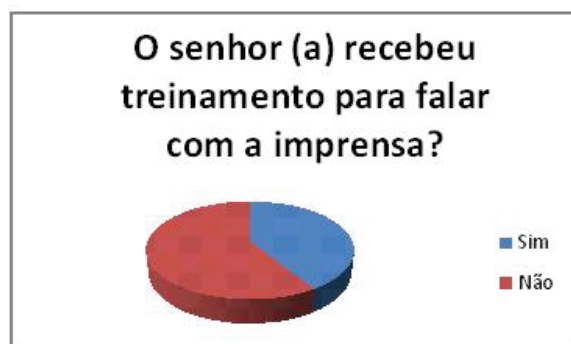
Quadro 1: pesquisa com gerentes do mercado financeiro

Fonte: A Finalização do Noticiário Econômico (1989-2002). Tese definida em novembro de 2009